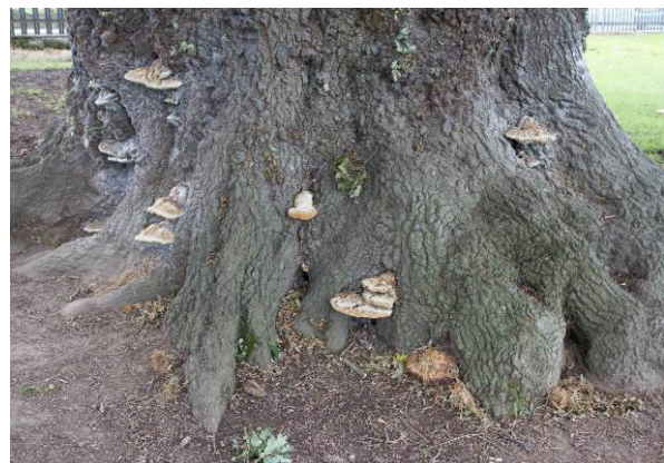
Plate 14. Base of ancient oak at Ysgol Bryn Gwalia