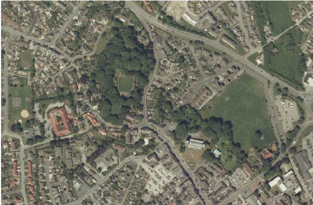
Plate 1. Mold aerial photograph from 2009

A 2016 study 12 published by CNC/NRW looked at urban canopy cover across Wales' towns and cities. Urban canopy cover is classed as the amount and distribution of urban land under tree or woodland cover when assessed using aerial photographs. The study was the first ever country-wide survey of its type in the world and found that the average canopy cover for Wales was 16.3% in 2013 and down from 17.0% in a previous 2009 survey.