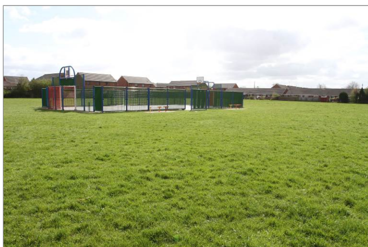
Plate 9. Park Avenue playing field, Saltney

As well as requiring maintenance tree planting schemes will require long term grounds maintenance regimes to be revised. Areas of mown grass can be cut with tractor driven machinery to within 5m of trees with a longer grass sward left underneath trees cut once or twice a year if desired. Where it is necessary to maintain regular mowing adjacent to a tree small ride-on cutting machinery can be used. Under no circumstances should grass trimmers be used at the base of trunks because this inevitably causes damage.