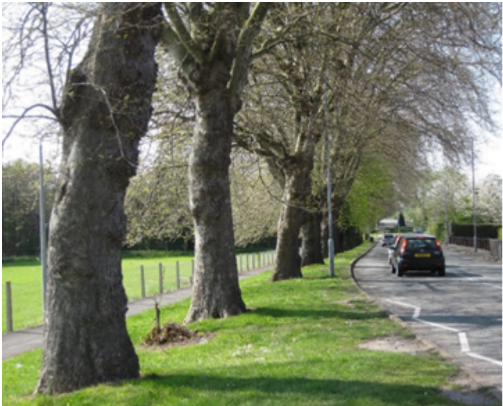
Plate 6. Mature highway trees in Flint

Planting within the pavement on streets is technically challenging and requires consultation with a wide range of stakeholders (e.g. highways engineers, utility providers, landscape and tree professionals). Planting must meet highways standards whilst creating suitable conditions for tree growth. Nevertheless, street tree planting can be extremely effective at improving the quality of the public realm. Due to the relatively high cost, planting in paved areas will usually be undertaken as part of externally funded regeneration schemes.