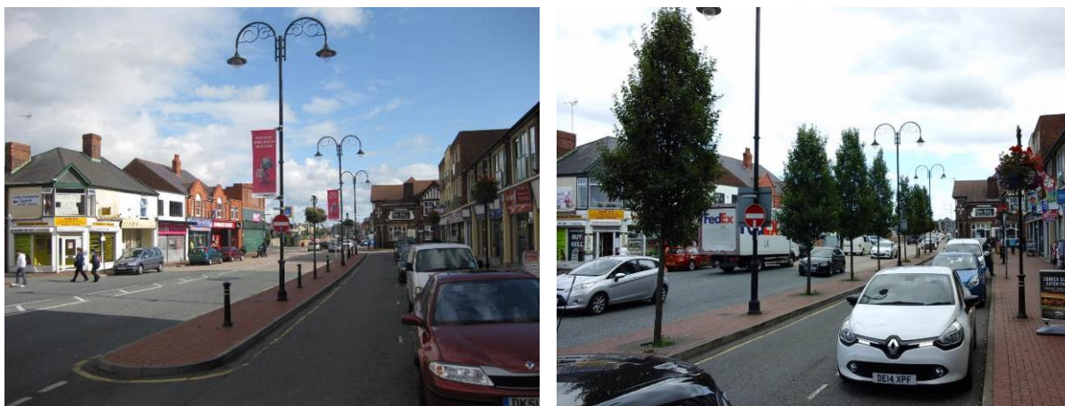
Plate 7 and 8. Flint street tree planting undertaken in 2013 (Before, left and after, right)