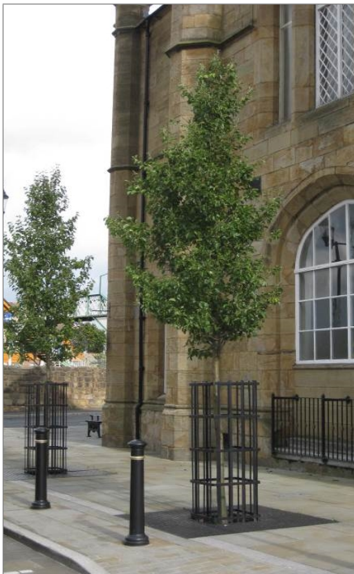
Plate 15. Treegeneration funded tree planting in Flint

The plan seeks to be a key document in securing funding from the Welsh Government under the Sustainable Development Fund and other Welsh Government grants that are expected to become available in the future. Occasionally grant funding for tree planting becomes available at short notice and the plan will be able to identify suitable sites that can be planted 'off the shelf' at short notice.