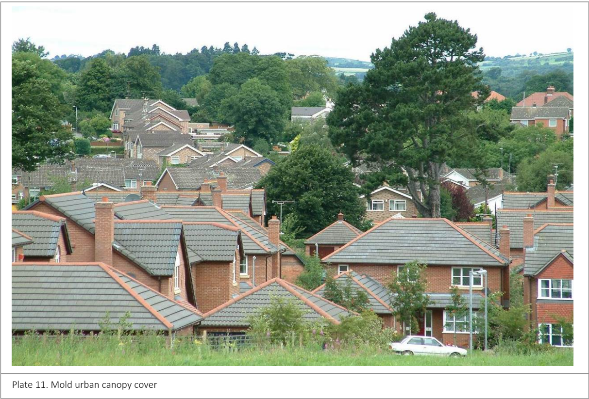
Plate 11. Mold urban canopy cover

The traditional approach tree management looked at a tree in isolation and what was required to solve that particular problem or issue. The traditional method was not strategic and tree canopy cover was not measured, so it was unclear whether or not it was sustainable. The advent of the urban forestry movement recognised that the whole urban forest resource is much greater than the sum of its individual parts and is a shared resource with a monetary value. To sustainably manage urban canopy cover the council will need to adopt the modern approach (Table 9).