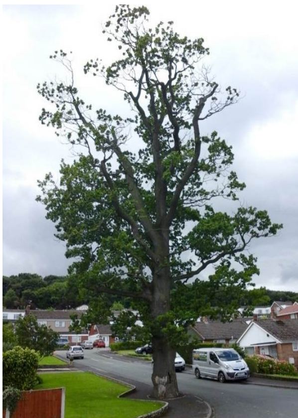
Plate 12. A mature oak in decline subject to frequent inspections

The risk of being killed or injured by a falling tree is frequently exaggerated. This is believed to be due to over reporting of incidents by the media, probably because they are considered to be a freak occurrence and newsworthy 37 . Statistically, the risk of being killed by a falling tree or branch situated in an area of high public use is extremely low 38 .