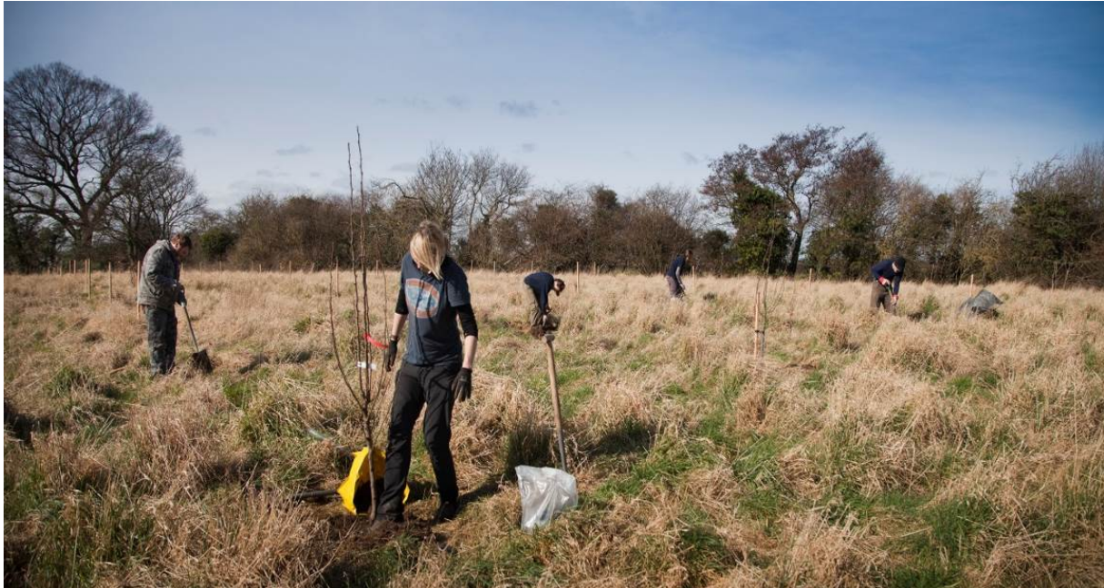
Plate 14. Volunteers planting orchard trees at Llwyni on the edge of Connah's Quay

Partners for the delivery of the plan will include town and community councils, with other partners potentially including Coed Cadw/Woodland Trust. The Countryside Service has already established good working partnerships and manages woodland at Caergwrlle Castle on behalf of the community council.