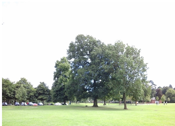
Plate 2. Mature trees and parkland at Wepre categorised as Formal Open Space

To increase biodiversity there is also the opportunity to sow wildflowers adjacent to trees where reduced grass cutting occurs as part of revised open space management.