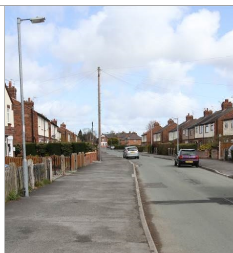
Plate 10. Park Avenue, Saltney