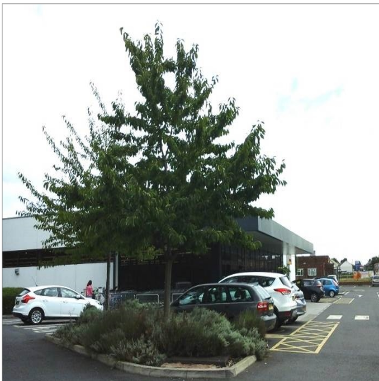
Plate 11. Landscaping in a new retail development, Flint

Policy L1 of the Flintshire Unitary Development Plan is the policy that supports landscaping and states that;