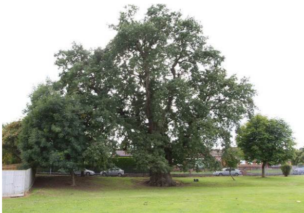
Plate 13. Ancient oak at Ysgol Bryn Gwalia, Mold

Ysgol Bryn Gwalia in Mold has an ancient pedunculate oak growing in the grounds with a trunk girth of 8.30m, the largest known in Flintshire. The oak is the school's emblem and the most accurate estimate of the tree's age using White 53 is 774 years. Despite the oak's great antiquity the tree is remarkably uniform and vigorous and because of this lacks veteran features.