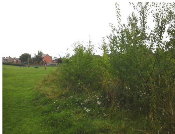
Plate 3. Whip tree planting undertaken at The Willows, Hope categorised as Formal Open Space

To assist with creating a diverse and resilient tree cover less common tree species will be used. These less common species will also provide added interest and will not look out of place in a more formal landscape. Within Formal Open Space there is an over reliance on mature and late mature trees to provide canopy cover and new planting will result in a more varied age structure.