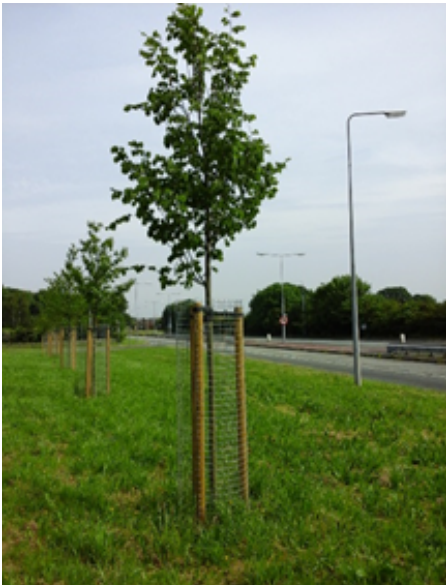
Plate 5. Planting in the soft highway verge

The widest verges will be suitable for planting at a higher density with small nursery stock whilst narrowest verges could be strategically planted with large specimens.