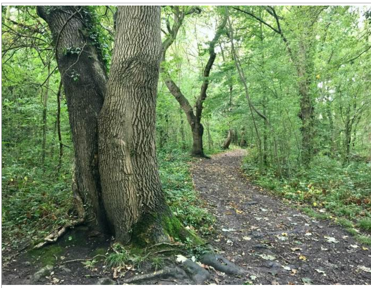
Plate 12. Urban woodland at Wepre Park

The council will protect and enhance its own urban woodlands guided by long term woodland management plans. Management plans will be based upon a policy of continuous cover so that long term canopy cover remains stable or is increased. Felling will only be carried out for overriding safety reasons, to facilitate natural regeneration or carry out new planting. Where felling is considered acceptable it will only be carried out in small woodland compartments or as a thinning operation. In exceptional cases young scrub woodland may be cleared to enhance particularly rare plant communities (e.g. limestone grassland), geological features (e.g. limestone pavement) or ancient monuments.